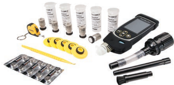
PosiTector CMM IS Pro Kit includes the PosiTector DPM Advanced

Replacement chambers, salt solutions, tools, caps, stackable probe extensions, and fins are available upon request